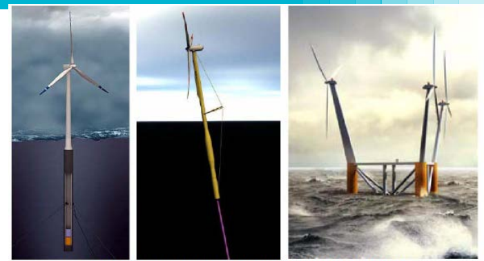
Fig. 1: Floating concepts, from left: HyWind, SWAY and WindSea.

Huge potential within offshore wind energy: 150 GW expected by 2030 in EU