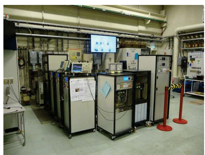
Laboratory testing of voltage droop control for a multi-terminal HVDC grid