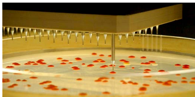
Automated picking of colonies in the high-throughput screening laboratory

The laboratory comprises both low-resolution mass spectrometers (optimized for sensitivity and quantitative analyses) and high-resolution instruments for elucidation of molecular structures. MS generally offers a very high analytical sensitivity that enables detection of extremely low concentrations (nanomolar/ppt levels), in combination with high specificity (ensuring confidence in identification). An ultrahigh-resolution high-field-strength FTICR-MS instrument