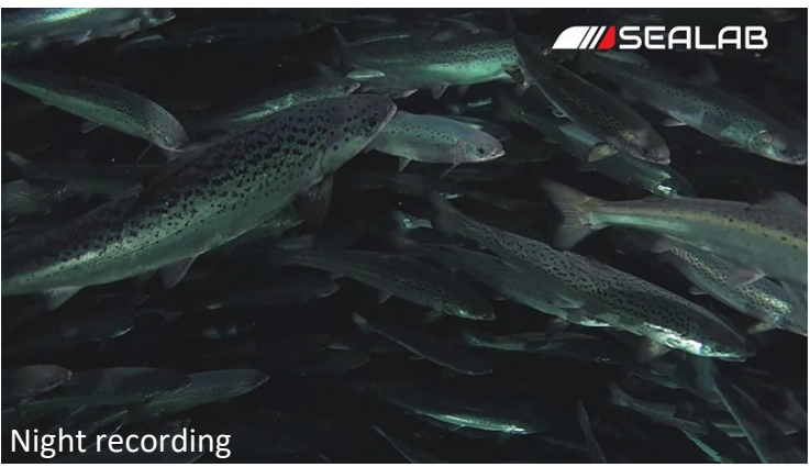
Figure 1: Video frame of salmon with SEALAB camera system.